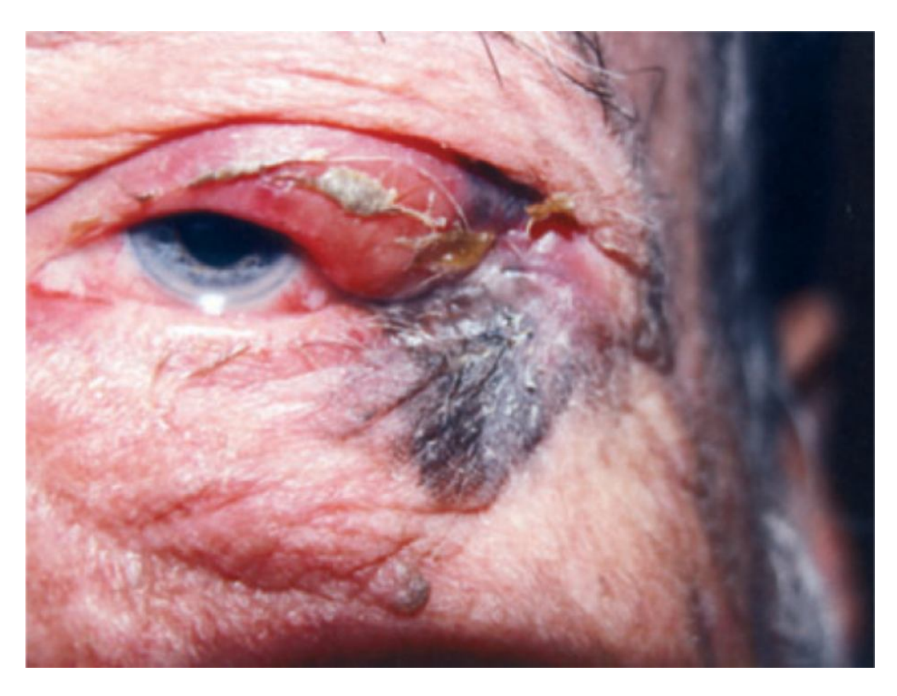
Figure 97-2 Advanced cutaneous melanoma of the eyelid with orbital extension.